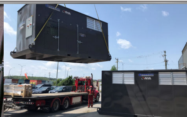
EASY HANDLING WITH LIFTING BRACKETS FOR CRANE